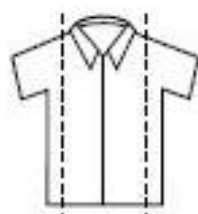
Comfort Fit has a looser fit.