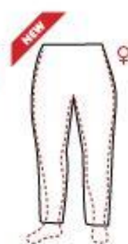
Curved Fit (W)