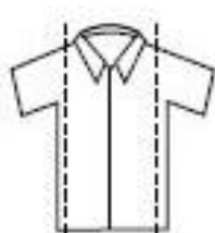
Regular Fit has a straighter fit.